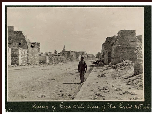
The ruins of Gaza 1917