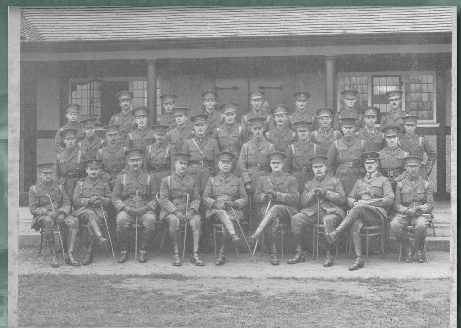
Officers of the 2nd Bucks Battalion in England, 1915

The 2nd Bucks Battalion launched their assault at 6pm on 19 July to try and capture Sugar Loaf Hill. It was reported that 'not a man was seen to waver, but the fire brought to bear was annihilating...the enemy machine guns literally mowed down the advancing waves; only a few men actually reached the German parapet...but none got back'. Of the 642 men from the Battalion who joined the assault, 133 were killed or missing believed killed and 189 wounded. Seven men from Marlow were amongst those killed and are remembered on the war memorial in All Saints' Church. Another man from Marlow was killed in the same battle serving with the Royal Berkshire Regiment.