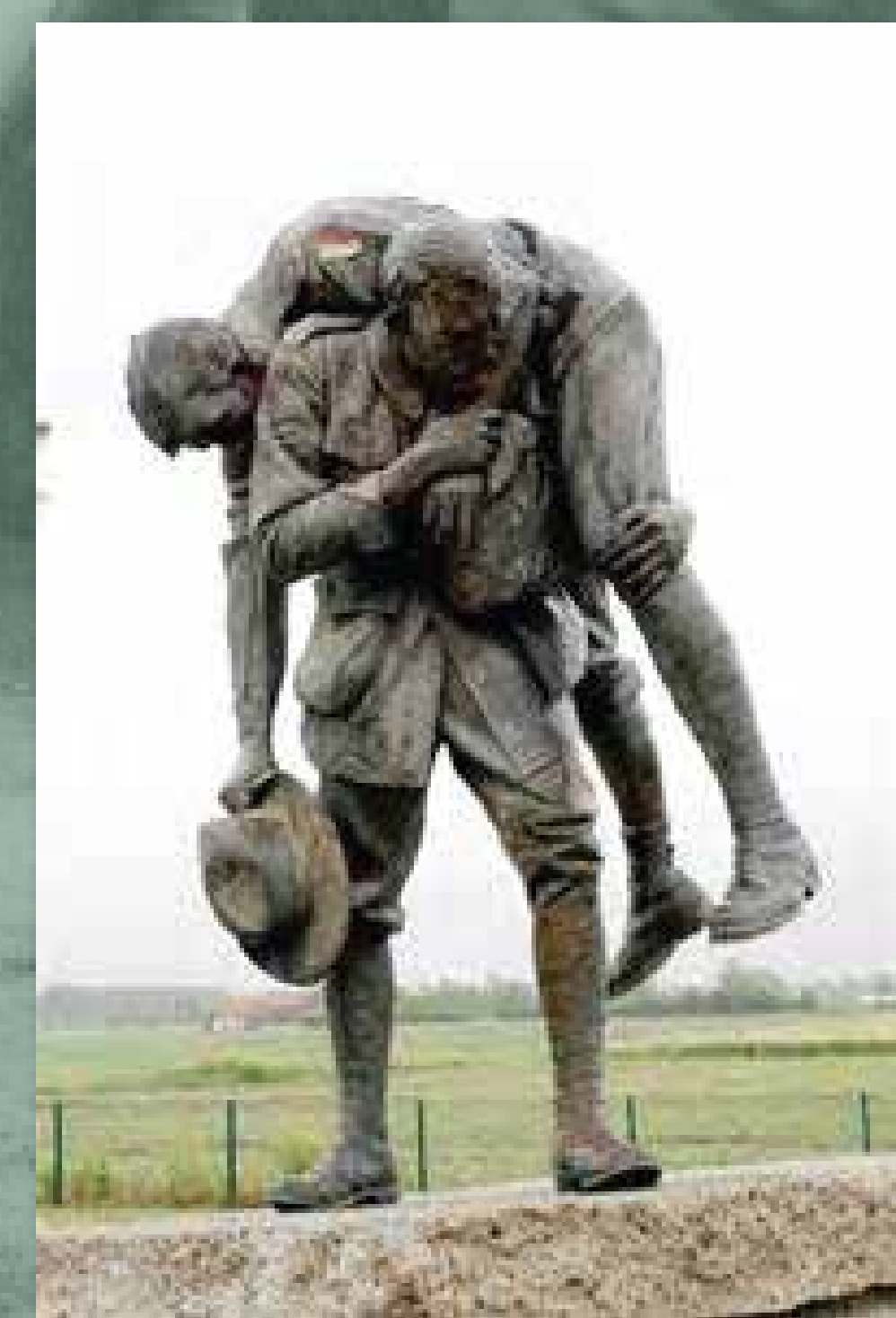
The "Cobbers Statue" at the Australian Memorial Park at Fromelles